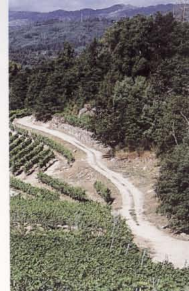
The area around Viña Mein is the origin of all Ribeiro's vines.